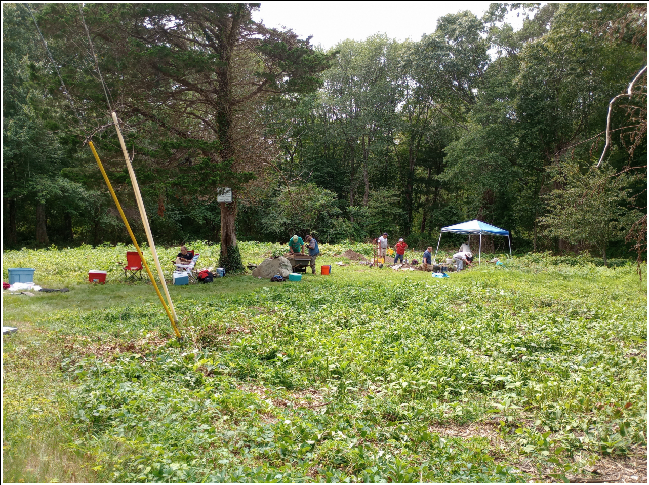
Figure 1. 2025 excavation area looking southwest.