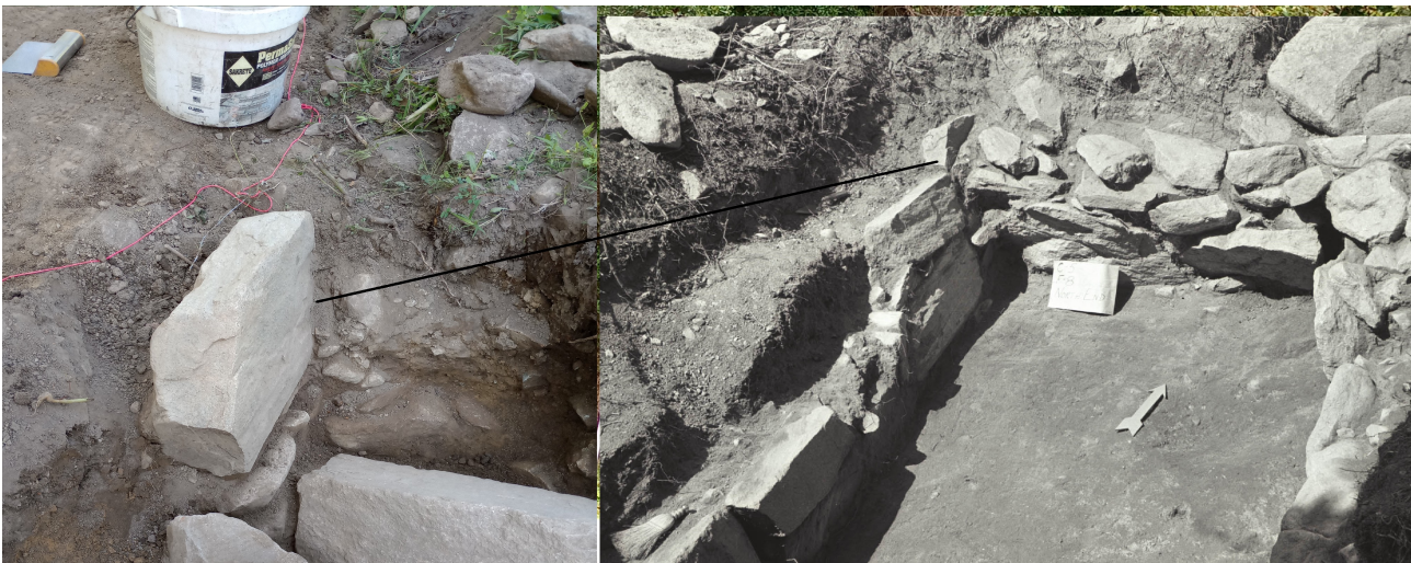
Figure 3. Stone found in 2025 with photograph from previous excavation of the same stone.

the previously excavated cellarhole in the 1950s or 1960s. The soil to the west of this feature in 2025-2 was dark and appeared to represent previously excavated soils that extended to an unknown depth. Unit 2025-3, to the east of 2025-2, also encountered the cellarhole with careful excavation of the southeast corner of the square reaching a depth of approximately 25.5" (65 cm) below the surface before immovable rocks were encountered.